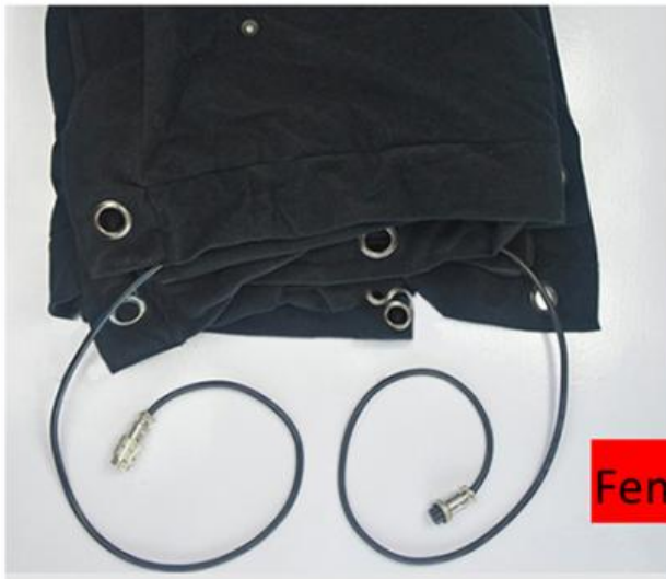
Female and male cable