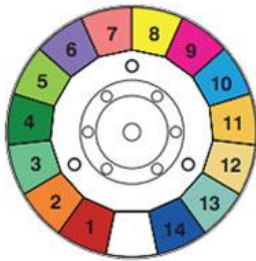
Color Dial: 14 colors + white color dial