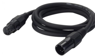
DMX Cable 16 DMX channels