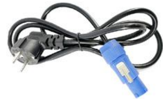
Power Cable Wide voltage, can use AC100V~240V±10%,50-60Hz