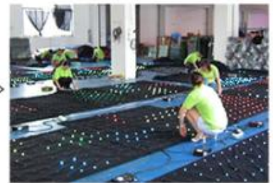
Inwtaii lamo bead