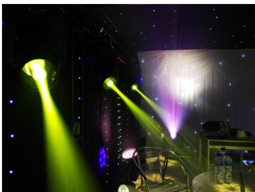
Bar night club