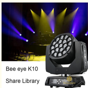
Bee eye K10