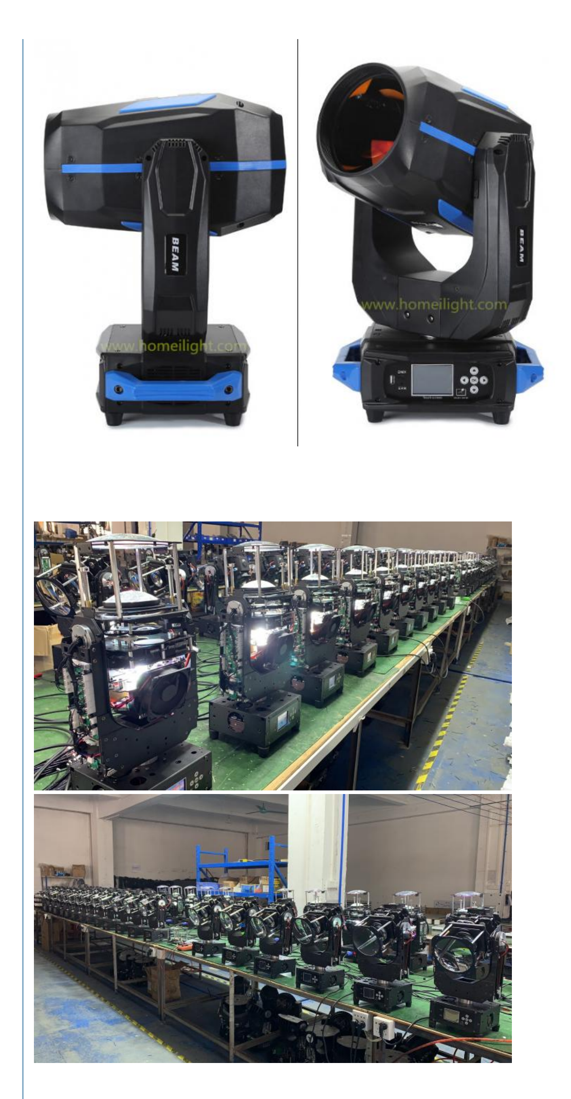
8. Q: If the products broken during the warranty, what shuold i do?