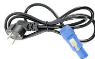
Power Cable Wide voltage, can use AC100V~240V±10%, 50-60Hz