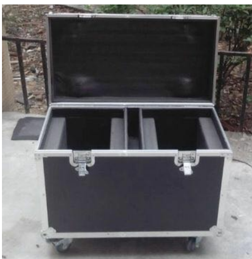
Flight Case (1in1,2in1)