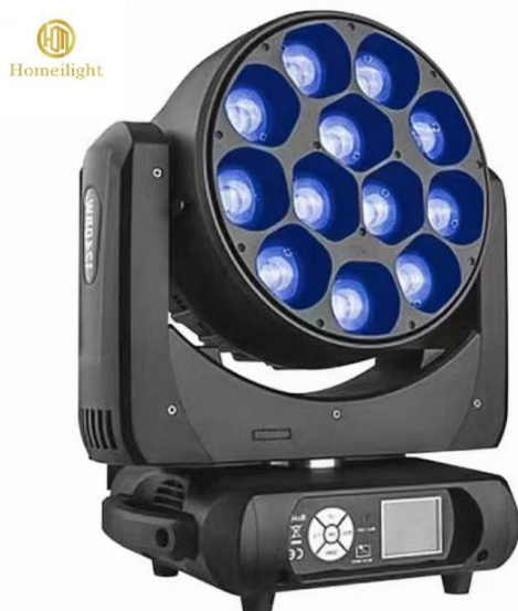
12*40W LED Zoom Beam Wash Moving Head Light

Display panel:blue LCD,Chinese and English, 180 degree rotation