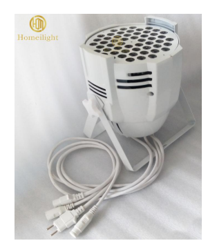
We can customize the white shell, please contact us if you need it.