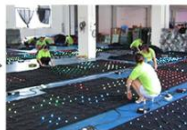
Inwtail lamo bead