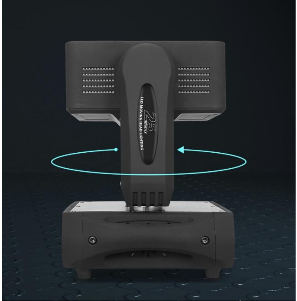
Promise rotation, wide irradiation area

The longer it is used, the smoother the surface, wear-resistant and scratch-resistant, and more convenient to use High brightness imported lamp beads, more durable