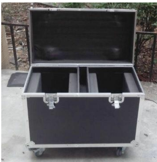
Flight Case (1in1,2in1)