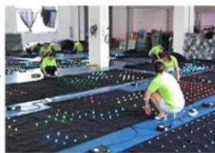
Inwtaii lamo bead