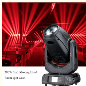
280W 3in1 Moving Head Beam spot wash