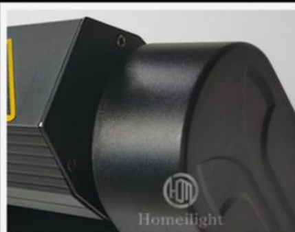
High Quality case