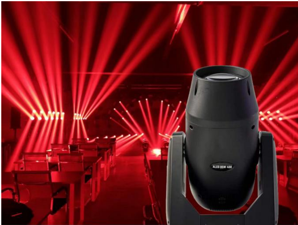
400W LED Moving Head Beam Spot Wash 3in1