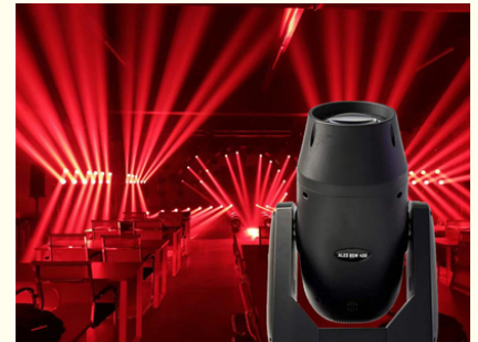
400W LED Moving Head Beam Spot Wash 3in1