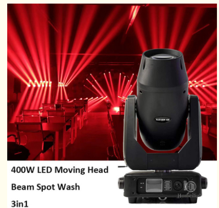
400W LED Moving Head Beam Spot Wash 3in1