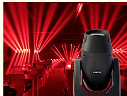
400W LED Moving Head Beam Spot Wash 3in1