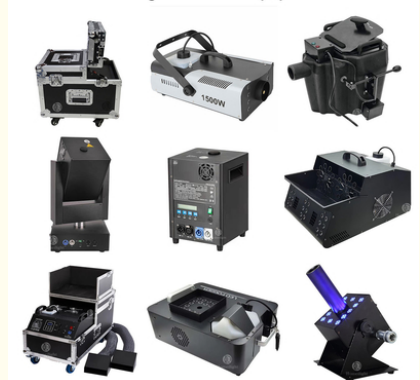
Stage Effect Equipment