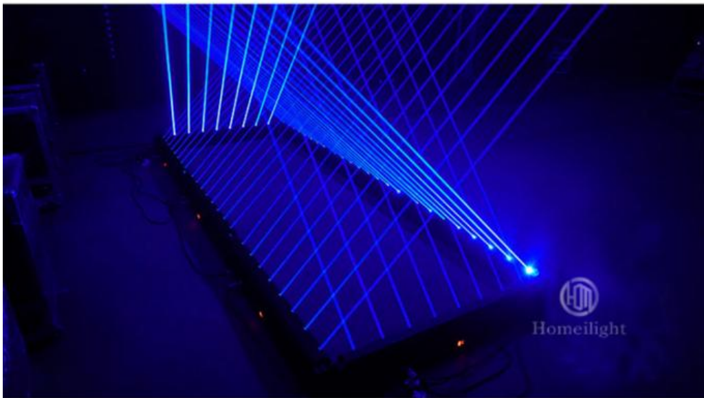
RGB 3in1 Full Color Laser