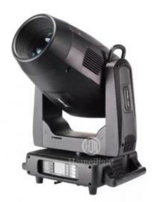
700W profile moving head