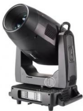
700W profile moving head