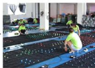
Inwtaili lamo bead