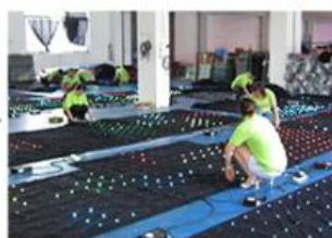
Inwtaili lamo bead