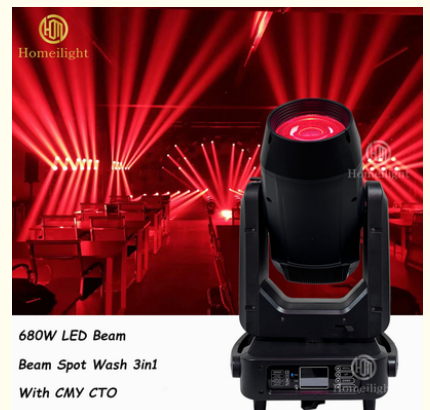
680W LED Beam Beam Spot Wash 3in1 With CMY CTO